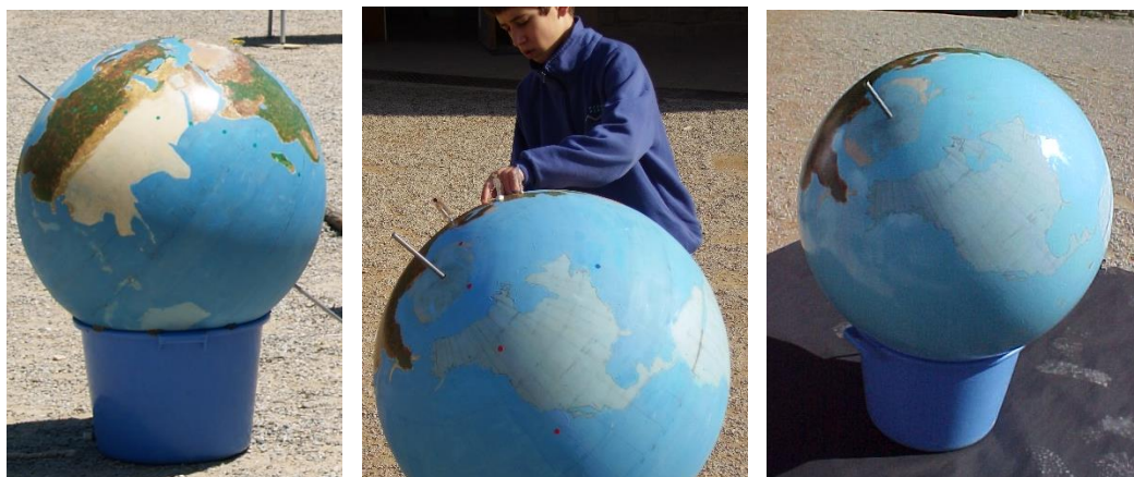
Fig. 4a: In the northern hemisphere, the north pole is in the sunny area therefore means it's summer for this hemisphere and we are observing the phenomenon of the midnight sun. In the southern hemisphere, the south pole is in the shade and winter. Fig. 4b: The north pole is within the area of the night, so in the northern hemisphere's winter. In the southern hemisphere, the south pole illuminated and therefore is

But the most interesting is to visualize the translation movement; this is how the sun / shade line is situated throughout the year. Thus it can be seen that in summer (figure 4a), winter (figure 4b) and equinox (figure 4c) as could check in the initial model with four land area (figure 1)