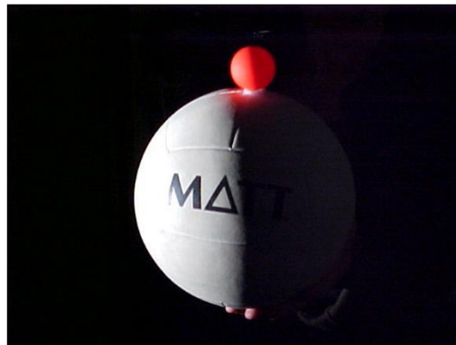
Fig. 2: A spotlight illuminates two spheres in the same way and produces the same areas of light and shadow

If a spotlight illuminates two spheres produces on them the same areas of light and shadow (figure 2), so if we orient correctly the globe will be the same area on the globe that is our planet and we can look at it as if we were an astronaut located more far from what is the ISS.