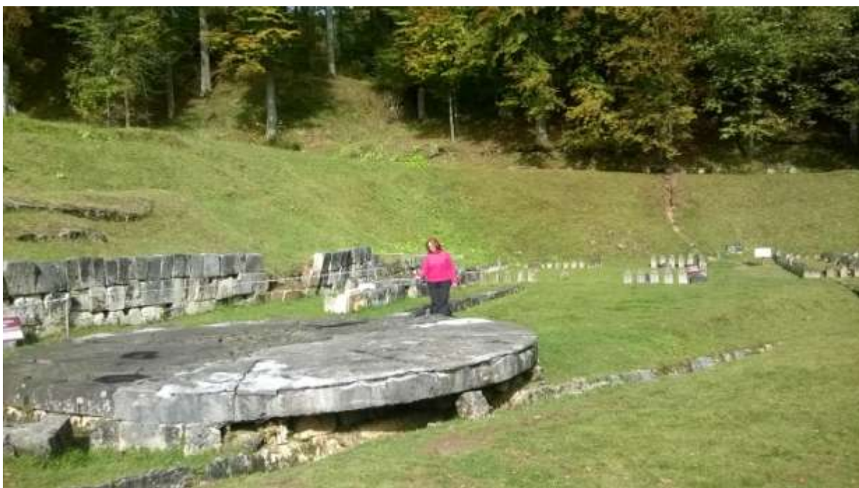
On the right side there is a circular astronomical calendar and on the left side is the miraculously andezit sun.