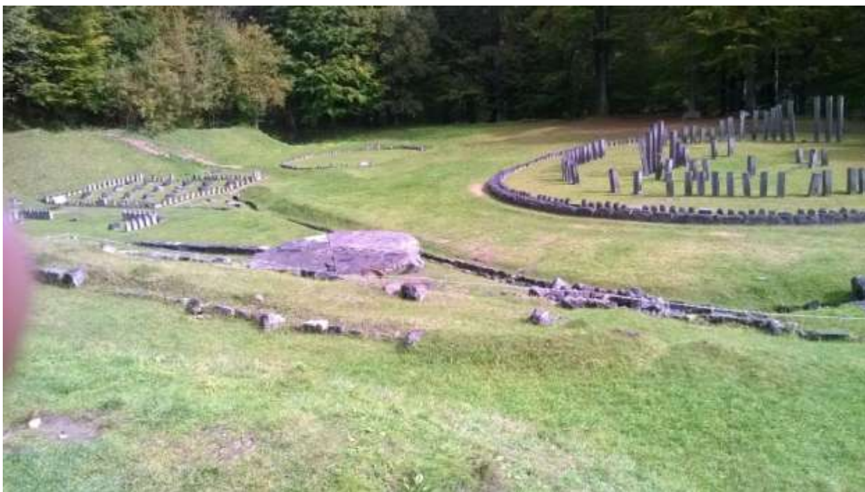
View of the sanctuary from Dacians' capital- Sarizegetusa