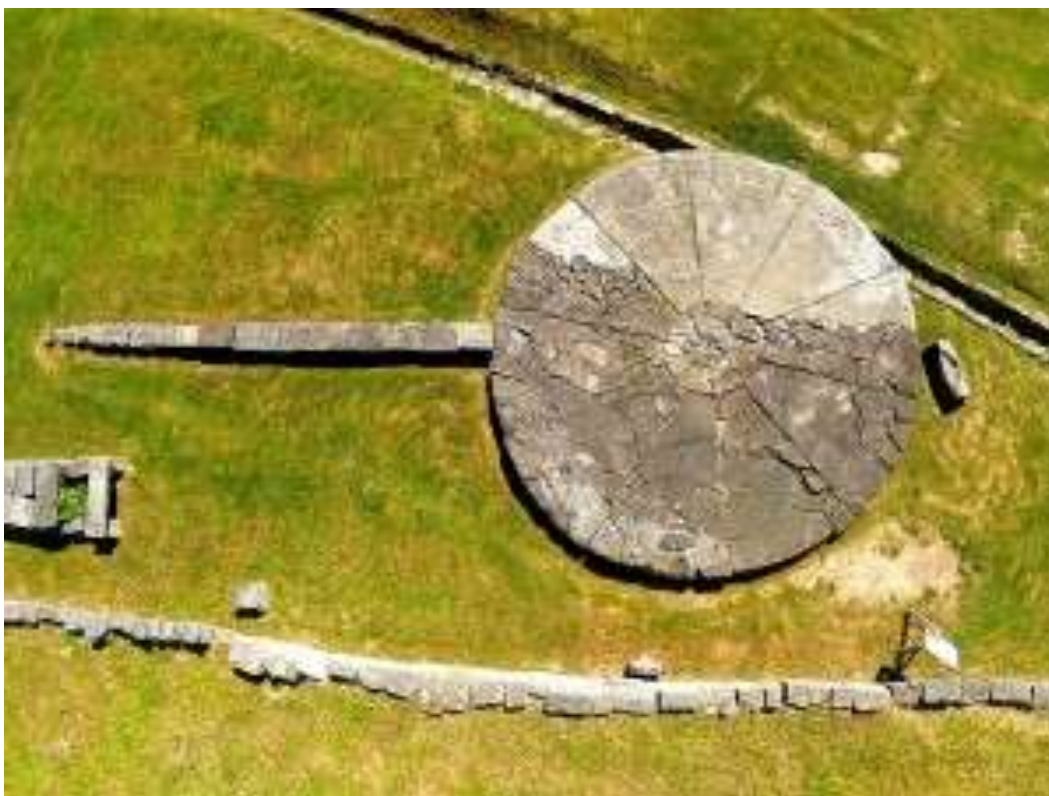
The Andezit Sun with its arrow