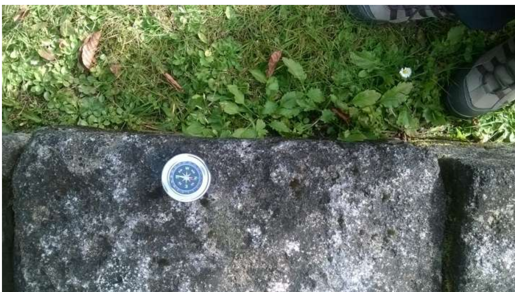
The compass shows the North-South direction of that stonemade arrow/extension. This picture shows the shadow on that extension of the sundial at real noon in October.